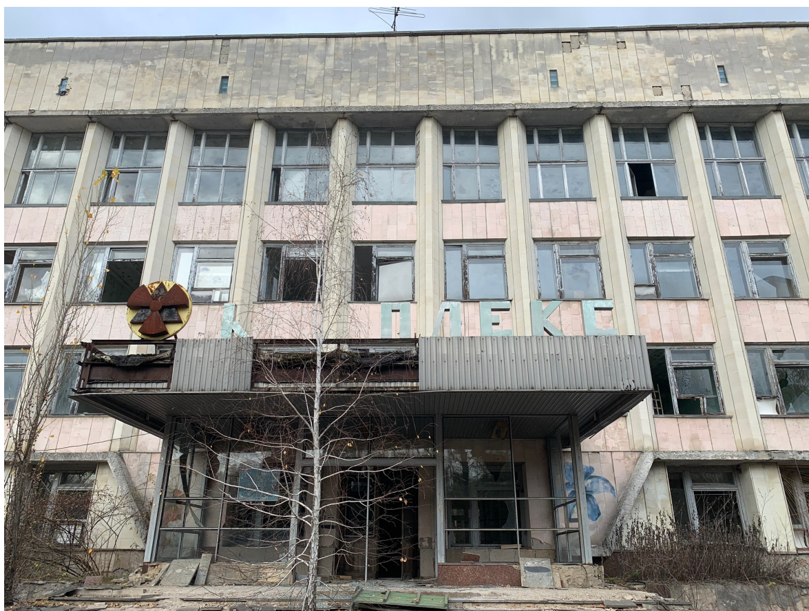
TAKEN WHILE VISITING PRIPYAT AND THE CHERNOBYL SITE IN 2019

IRPA and its affiliated Associate Societies aim to promote the protection of people and the environment from radiation, including the prevention and mitigation of radiological events. IRPA welcomes the efforts of our Ukrainian colleagues to maintain the proper functioning of the nuclear installations as far as possible in a very difficult context and commits itself to helping them should they seek IRPA support on radiation protection issues. My thoughts are especially with our Ukrainian colleagues, their families and their community