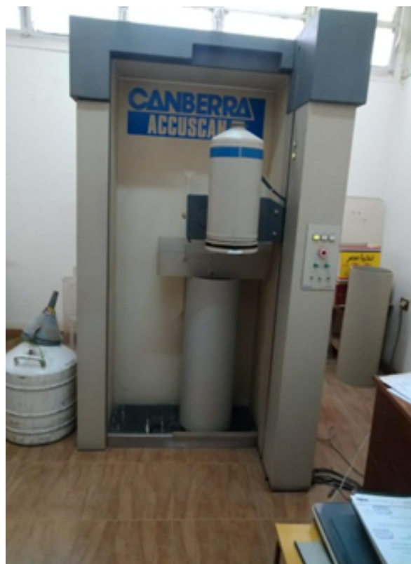
DEPARTMENT TLD SYSTEM FOR PERSONNEL DOSIMETRY AND WHOLE BODY COUNTER