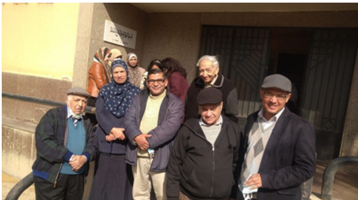
RECENT PHOTO AT THE ENTRANCE TO THE DEPARTMENT. REAR: WOMEN IN RADIATION PROTECTION.