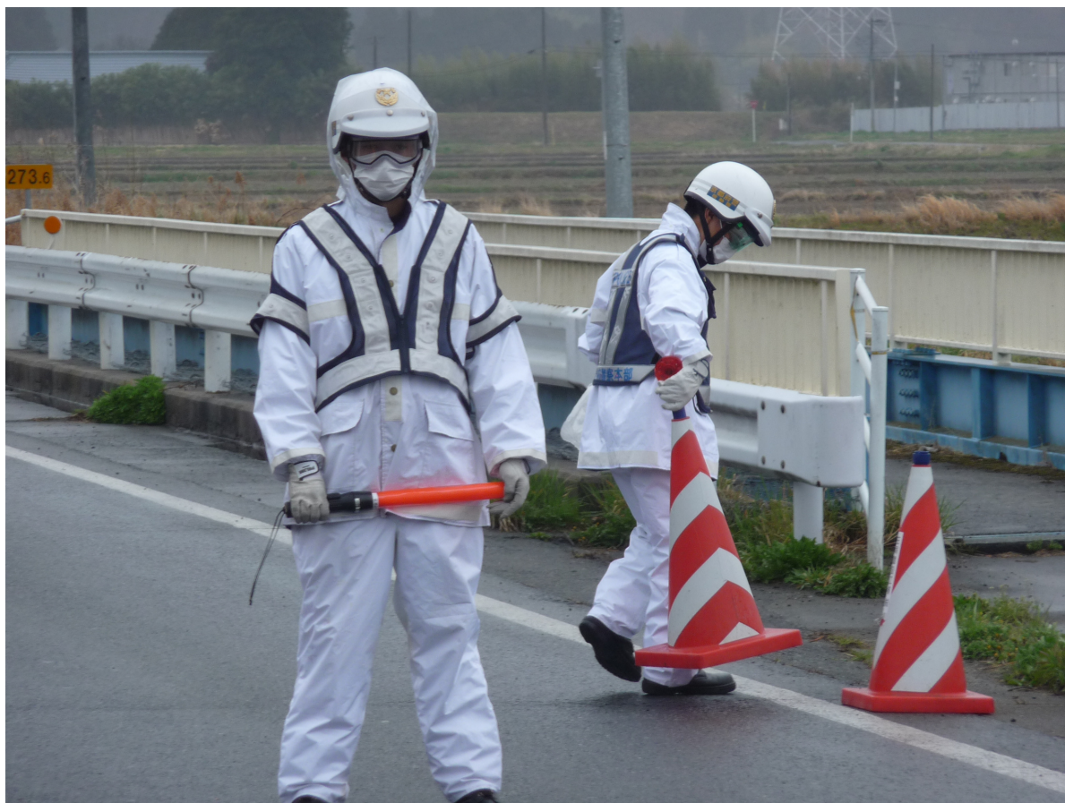
AT THE 20 KM BOUNDARY OUTSIDE FUKUSHIMA

More content is planned for this new topic page, beginning with the addition of Japanese press briefings and other information from the very early days of the disaster. Be sure to check back regularly as we add more information!